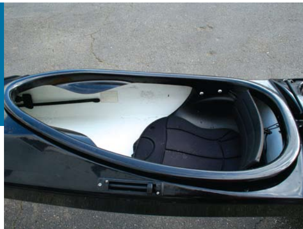
The lever in the cockpit is used to adjust the foot braces. The skeg control is on the port side, far enough forward to be easily seen.

“This is a pretty low-volume boat. You could camp three or four days. The white